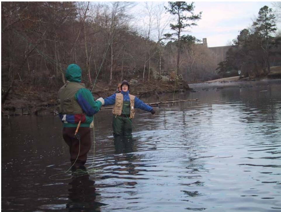
The one that got away.