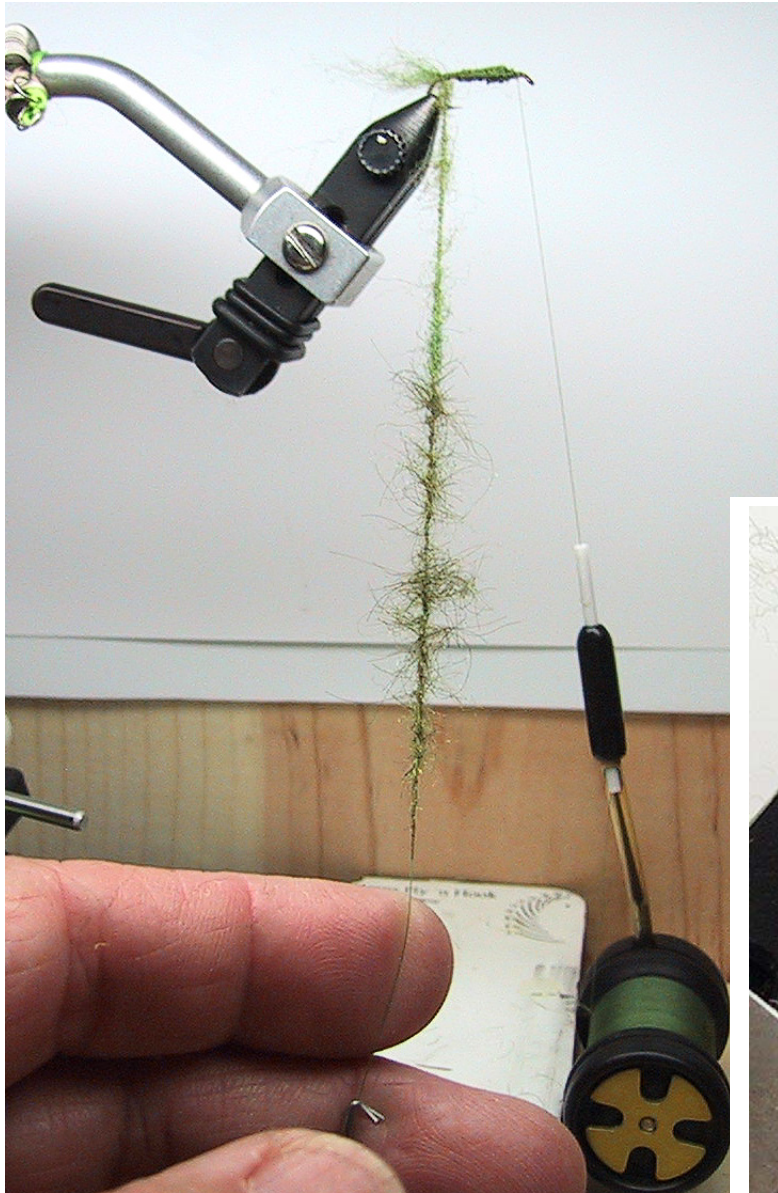
← The dubbing rope 5.1